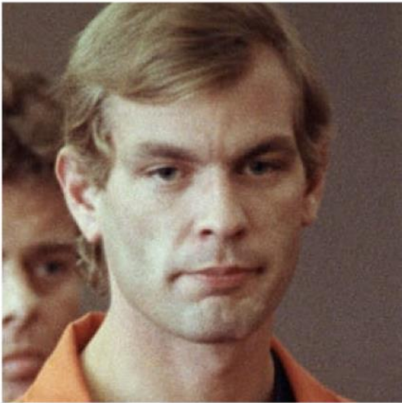
Jeffrey Lionel Dahmer (May 21, 1960 – November 28, 1994)