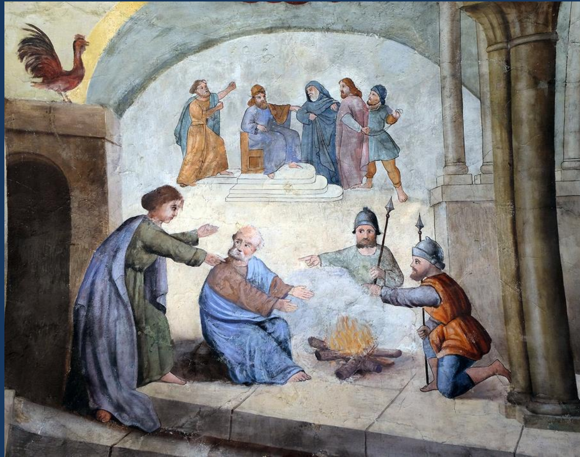
Fresco at the Church of Saint Matthew in Stitar, Croatia.